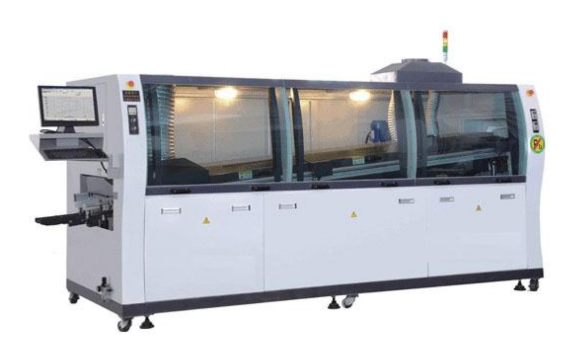
Computer Lead-free Dual Wave Soldering Machine